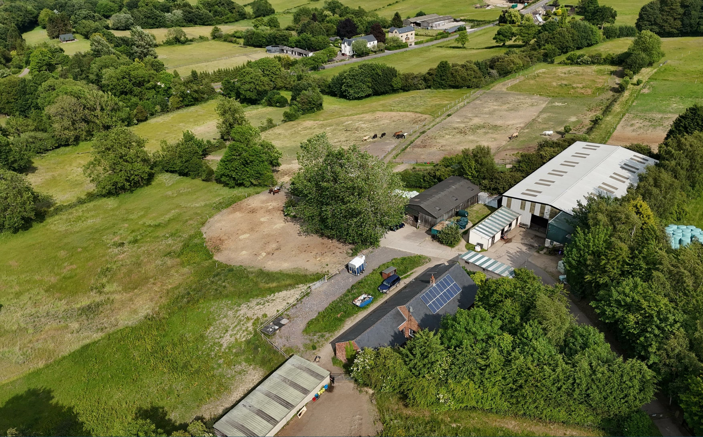
Snowdon Farm Riding School Snowdon Lane, Troway, Marsh Lane,